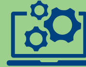
Shared Data Suites